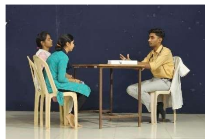
Skit By Students