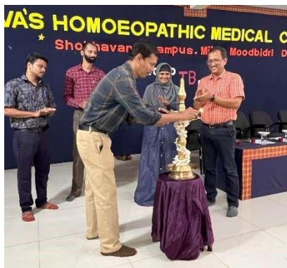
Lightning The Lamp