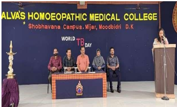
Dignitaries On Diaz