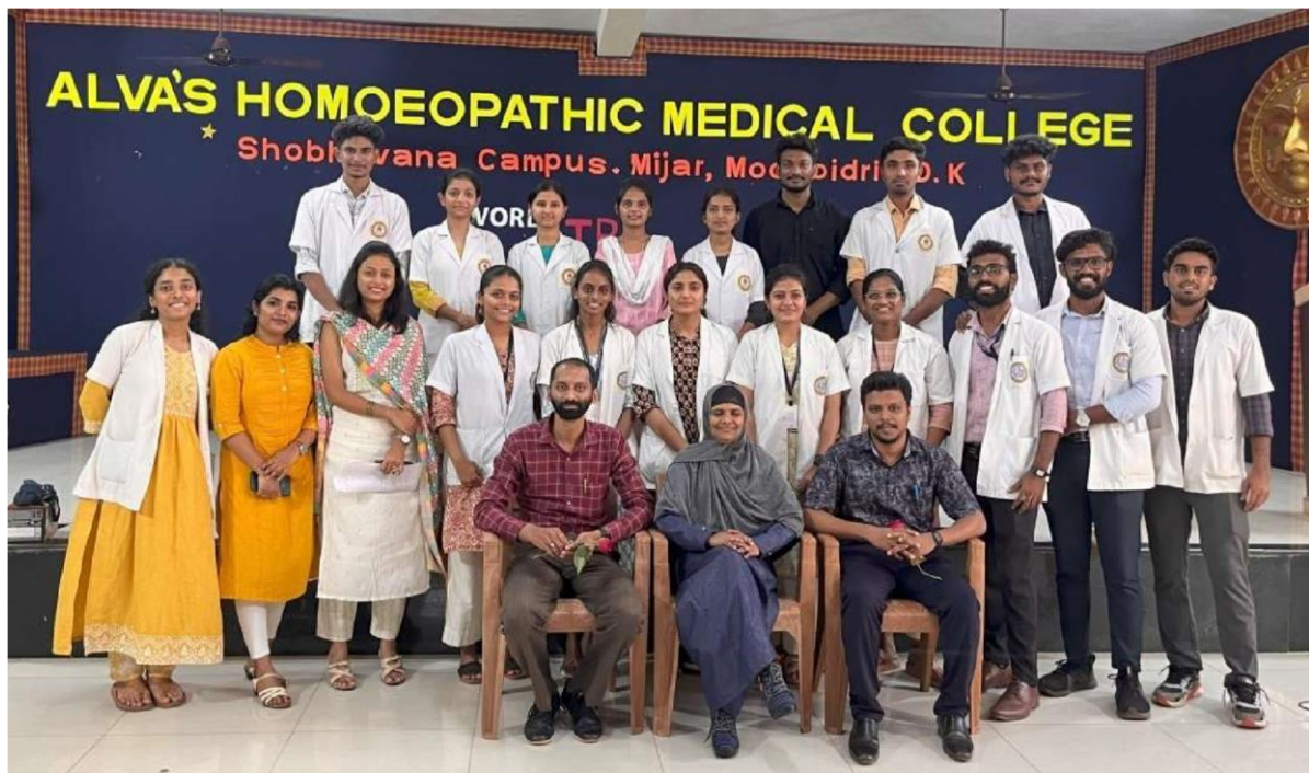
The Organising Team